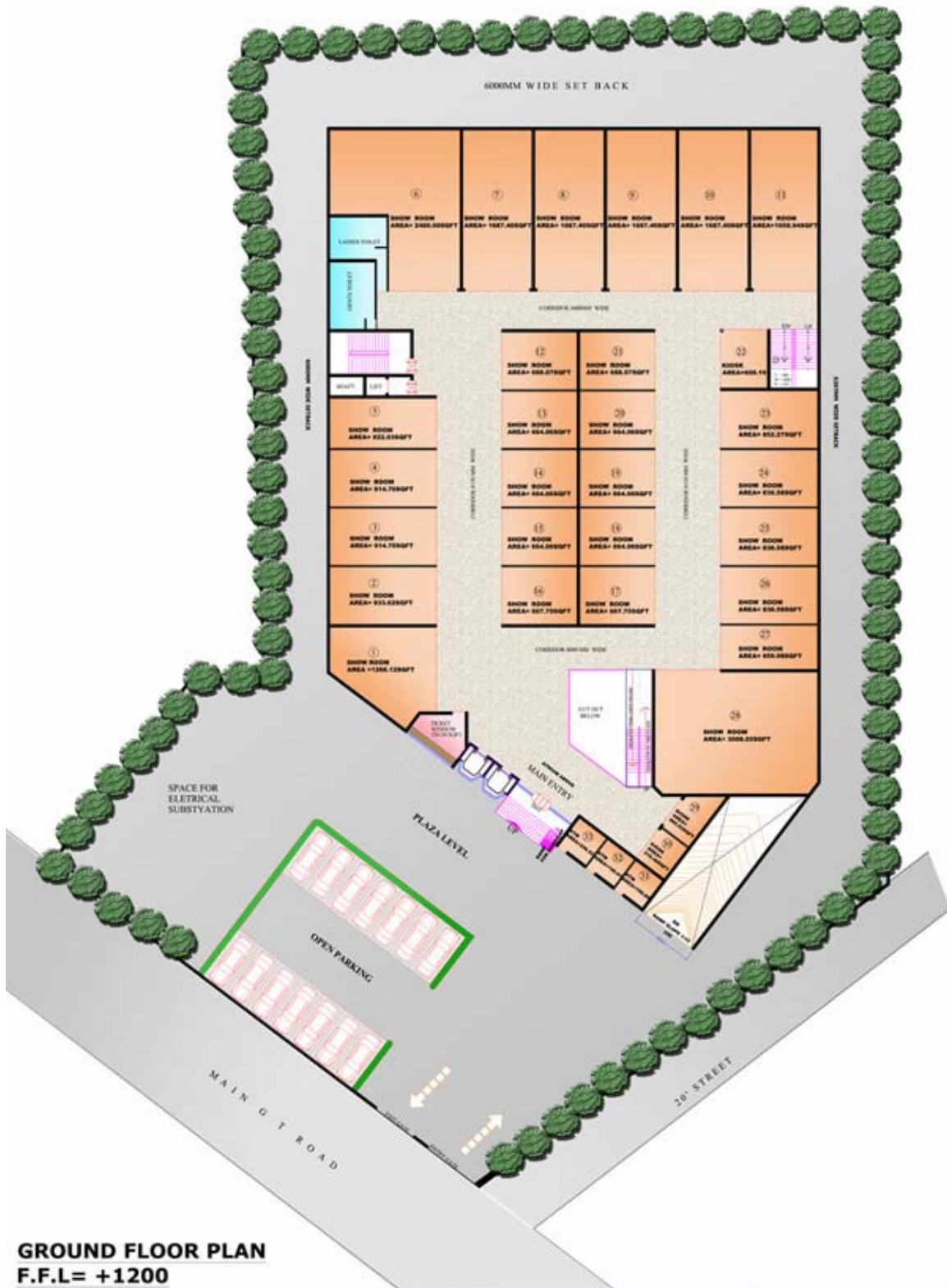
GROUND FLOOR PLAN F.F.L= +1200